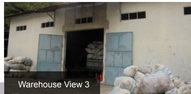
Warehouse View 3