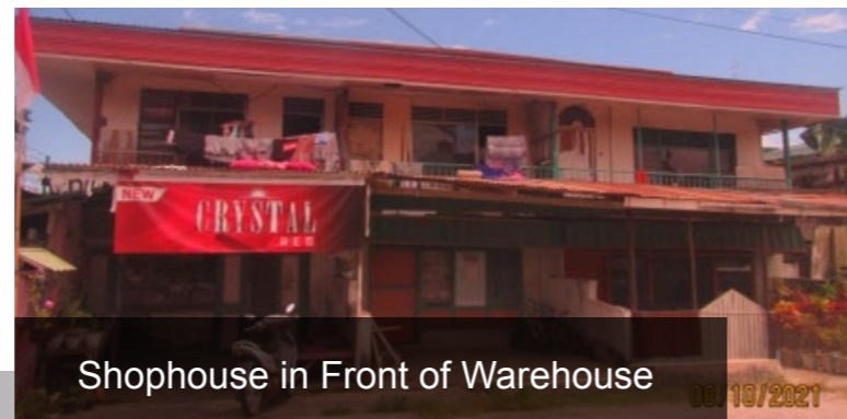
Shophouse in Front of Warehouse