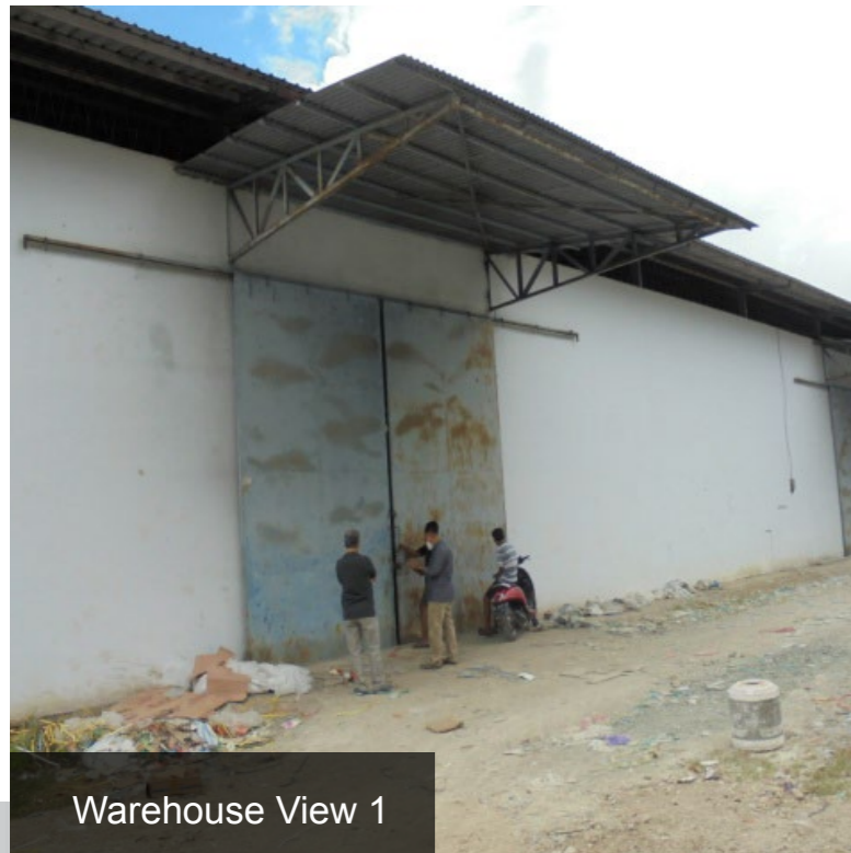
Warehouse View 1