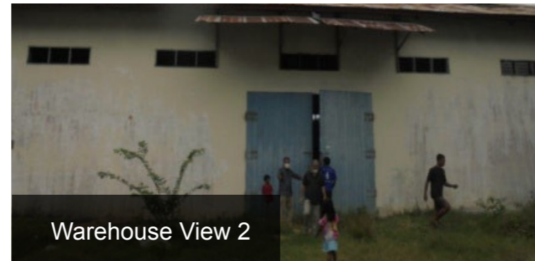
Warehouse View 2